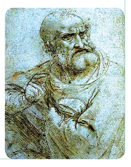
Figure of St. Peter in Leonardo's celebrated Last Supper, painted for Milan's Santa Maria delle Grazie.

WHAT IS BAL? HOW IS IT PERFORMED? HOW SHOULD WE READ IT? IS IT USEFUL FOR THE DIAGNOSIS AND FOLLOW-UP OF PATIENTS WITH INTERSTITIAL LUNG DISEASES? SHOULD IT BE READ BY A PATHOLOGIST OR BY A CLINICIAN?